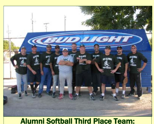
Alumni Softball Third Place Team: The Class of 1989