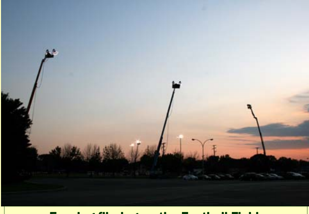
Evening filming on the Football Field.