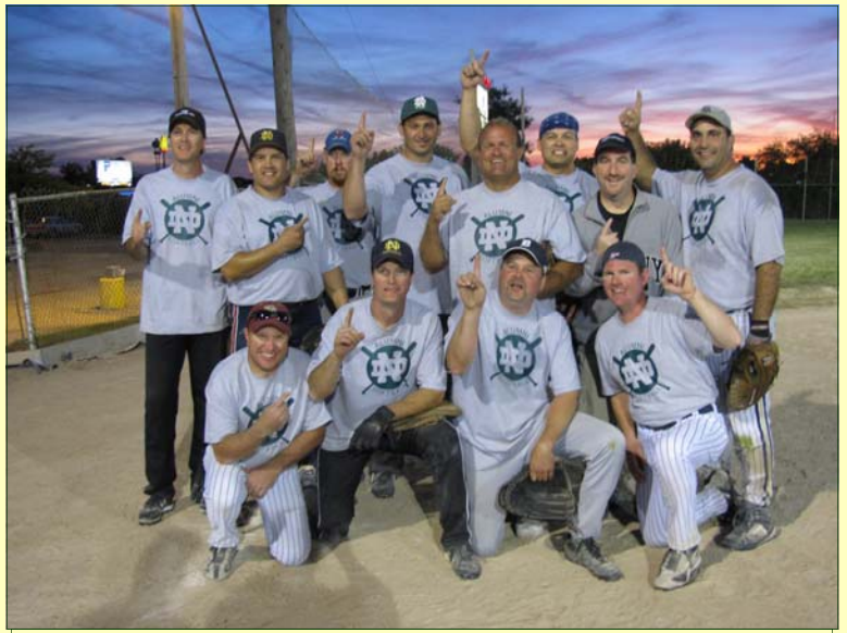
2009 Alumni Softball Tournament Champions: The Class of 1987

The annual Friends of Notre Dame alumni softball tournament took place Saturday, September 19, 2009. Approximately 80 guys participated this year. Some exciting softball took place! One highlight included the class of 1989 shutting out the class of 1997 twenty-five to nothing! Please visit our website to see all of the photos from the event.