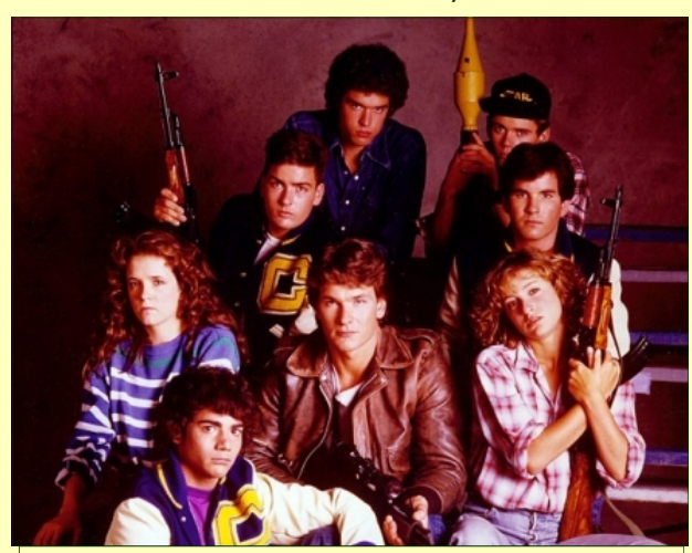
The original cast from the 1984 Film Red Dawn

WOLVERINES!!! Who didn't leave movie theaters screaming that famous line from John Milius's 1984 movie "Red Dawn"? When the remake of the 1980's cult favorite arrives in theaters next year, alumni and friends of Notre Dame will see some very familiar sights. Film crews set up shop on the football field at Notre Dame High School on September 8th. Wolverine Productions LLC/Contra Films is working on the film which will be distributed by