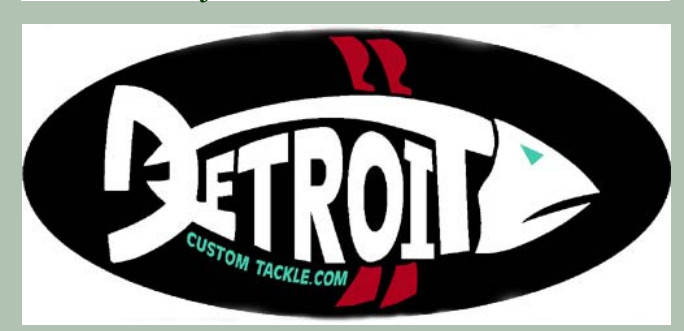
Eric Woodhouse '91 - Co-Owner